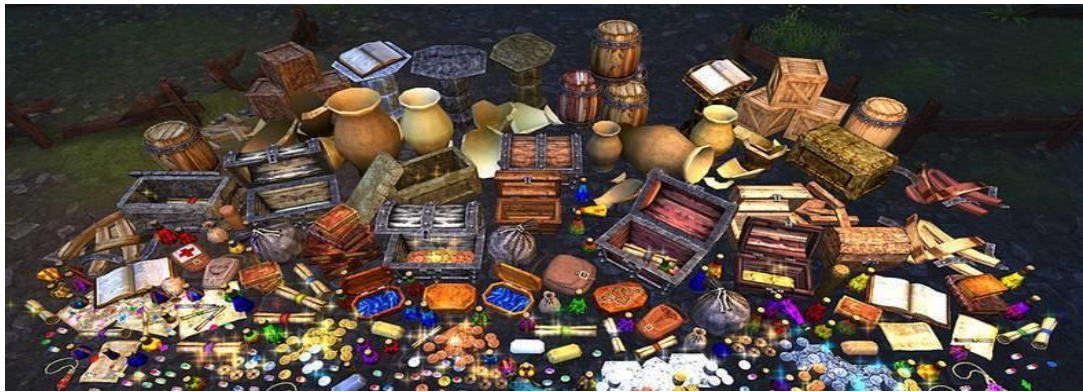
Image 1 - Model for fantasy games