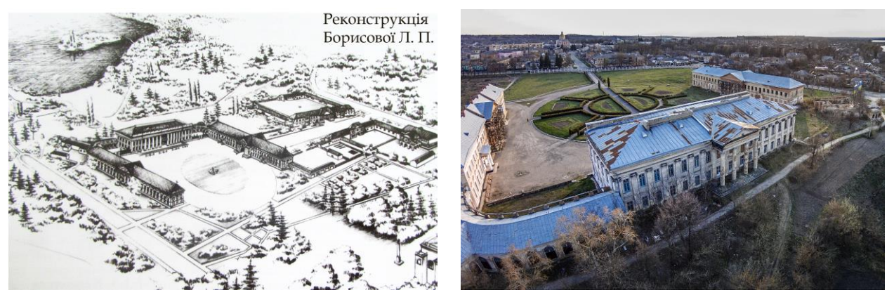
Fig. 4. Estate reconstruction (Borisova, 1974)

The pediment tympanum of the eastern and western wings was filled with a high relief heraldic composition and weapon attributes included ancient torsos wearing the cuirass and the helmet with count crown flanked the weapon and prolonged shields (Fig. 5). The latter contained the monogram of the letters «SP» meaning Stanislav Pototskyi. From the side of accessed road the shield of the tympanum have the family arms: to the left – «Pilawa» of Pototskyi family, to the right the fan of seven ostrich feathers – the arms of the Mnishek family (Lobko, 2008).