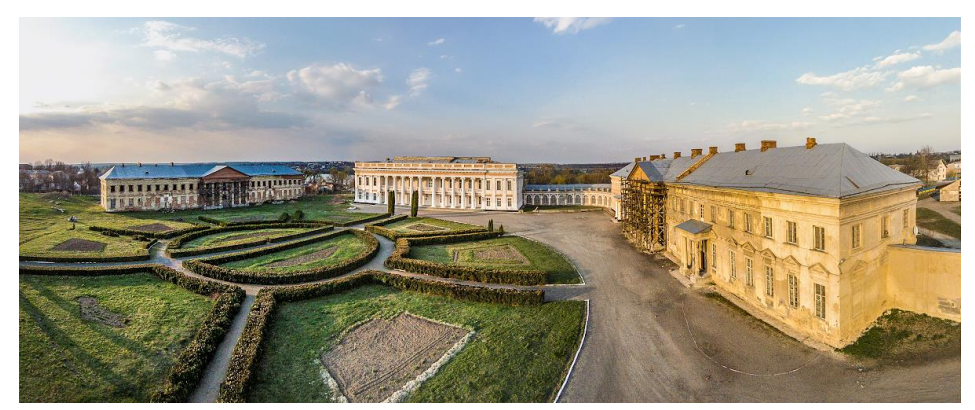
Fig. 1. The Pototskyi Palace in the town Tulchyn.

The historic preconditions of creating the palace ensemble in Tulchyn trace their roots to the 15th century. Modern Tulchyn is a district center located in the south part of Podillia Plateau, 82 km from the region center of Vinnitsia. The town came into being in the 15th century in the territory that at first constituted the Grand Prince Land Fund of Lithuanian state (Setsinski, 1911). The Polish historians of the 17th century assume that this settlement had the name of Nestervar and was built on the bank of the river Silnitsia. The main and the first mentions of this settlement date back to the early17th century, the time of its belonging to the major Polish magnates Kallinovski by which the castle and a wooden Catholic church were erected (Krzyżanowski, 1862). Due to Zboriv Agreementsigned signed in 1667 Nestervar was added to Cossack regiment of Bratslav Voivodeship, and after Andrusiv agreement signed in 1667 joined Polish-Lithuanian Commonwealth (Guldman, 1901).