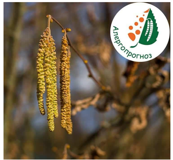
Figure 2. Service of pollen forecast for Ukraine at the allergy.org.ua website

In addition, one should not forget that symptoms of both allergy and asthma depend on the current air quality. The issue of air quality is especially important now, when Ukraine experiences war with Russia. Various destructions, caused by bombing and fires, aggravate air quality not just in the areas of active hostilities, but in other regions too and lead to the worsening of the human symptoms. Thus, problem remains unsolved; due to the absence of robust models and mobile applications people in different areas do not have appropriate and timely information about the current health risks.