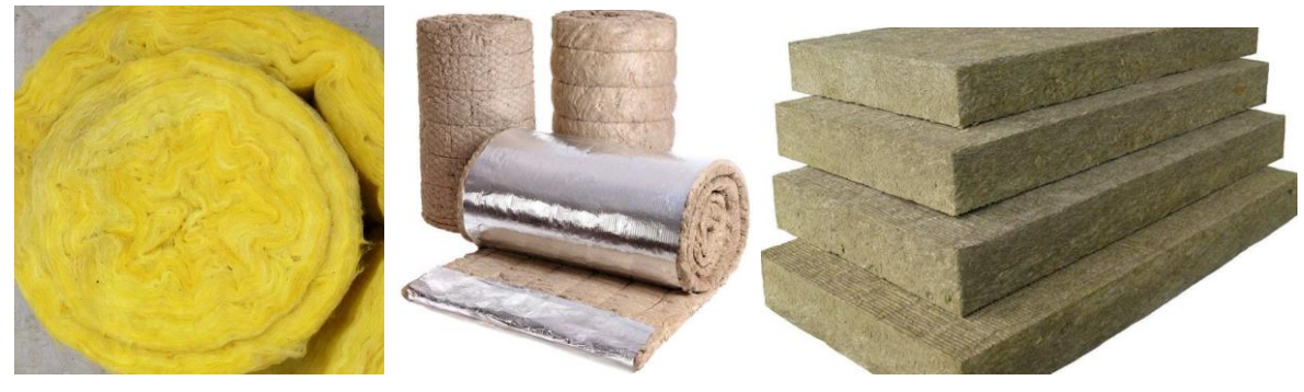
Fig. 3. Products from mineral and glass wool

Hollow blocks for erection of walls and floors [5]: