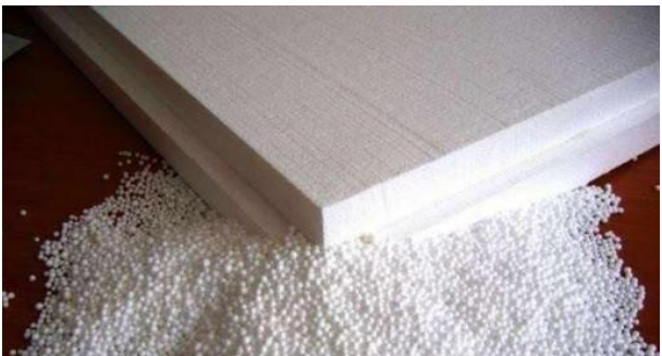
Fig. 1. Styrofoam and plates from it

Styrofoam - is considered the most common insulation, it is used for both external insulation of apartments and private homes (fig. 1). 98% expanded polystyrene consists of air enclosed in small closed cells, which provides low thermal conductivity and low water absorption and vapor permeability. Advantages: well resists dynamic loading, moisture resistant, does not settle, low vapor permeability - 0,05 mg / (m· h·Pa), average density to 35 kg / m3. Disadvantages: is a combustible material (flame retardant additives give it the ability to self-extinguish), inelastic and resistant to ultraviolet radiation, can not withstand temperatures above 90 ° C.