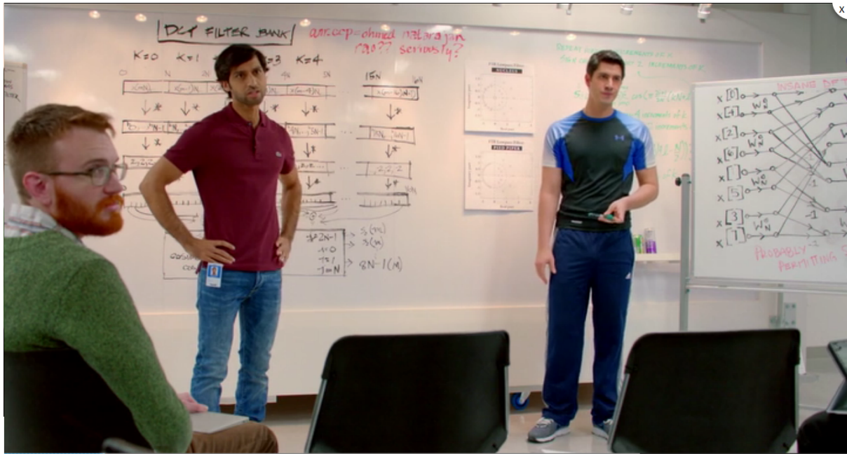
Fig. 2 Usage DCT filter bank