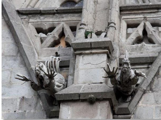
Figure 3 representation of the gargoyles found in the Basilica

The highest tower, known as "Tower of the Condors ", which is 115 meters high, and instead of gargoyles only presents condors, since they need at least this height to be able to fly. This detail is highly representative, since the condor is the national bird of Ecuador and is crowning its national coat of arms, just as it crowns this temple.