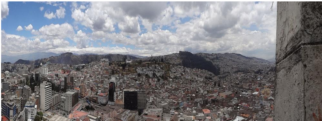
Figure 4- view from the top of the basilica.

The highest tower, known as "Tower of the Condors ", which is 115 meters high, and instead of gargoyles only presents condors, since they need at least this height to be able to fly. This detail is highly representative, since the condor is the national bird of Ecuador and is crowning its national coat of arms, just as it crowns this temple.