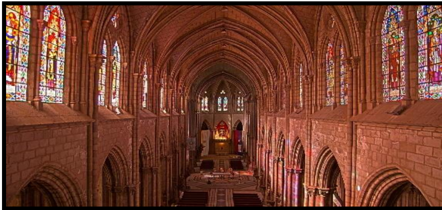
Figure 2- Inside the basilica

The nave of the church has a length of 140 meters, a width of 35 and 30, where 14 bronze images are tall, representing 11 apostles and 3 evangelists. (Figure 2 representation of the ship where the images of bronze are appreciated) Another important part of the basilica is the pantheon of the heads of the states of Ecuador, which are buried there. The space of the transept, which crosses the hole, forms a cross. The marble altar was originally planned to be placed at the head of the central nave. The cross is designed so that no noise is heard from the street.