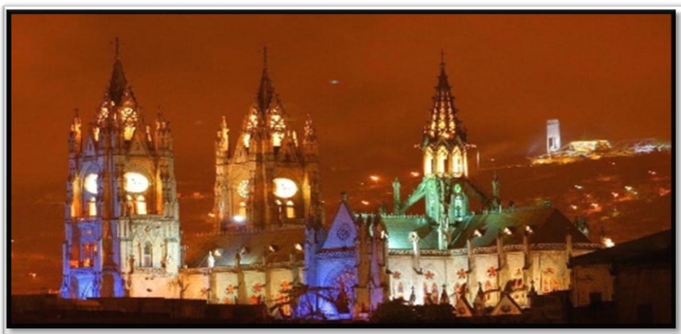
Figure 5- Night illumination of the basilica