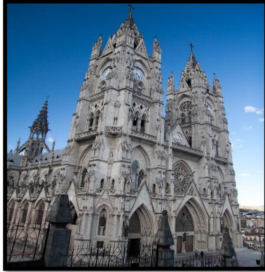
Figure 1- Height and structure of the basilica

It is located in the central part of the city, in the streets of Karchi and Venezuela near the monastery. This religious temple was built in memory of the consecration of the Ecuadorian state of P0the Sacred Heart of Jesus, during the presidency of Gabriel García Moreno in 1873.