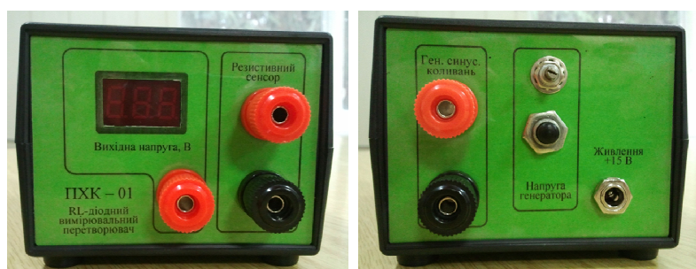
Fig. 1. Resistance-to-voltage converter using RL-diode generator of chaotic oscillations

Resistance-to-voltage converter using RL-diode generator of chaotic oscillations is shown in Fig. 1.