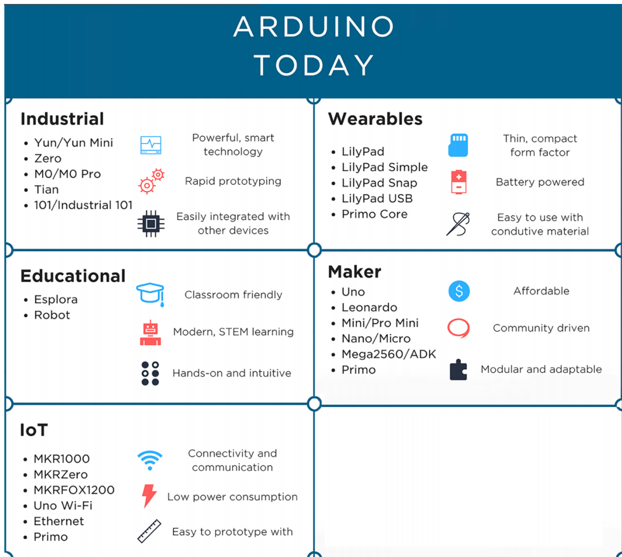
Figure 2 – Arduino today [4]

The Arduino IDE (Integrated Development Environment) is built upon Wiring – a software project written by one of Banzi’s students (Hernando Barragan). It provides easy-to-use libraries which hide some of the raw C++ going on behind the scenes. [2]