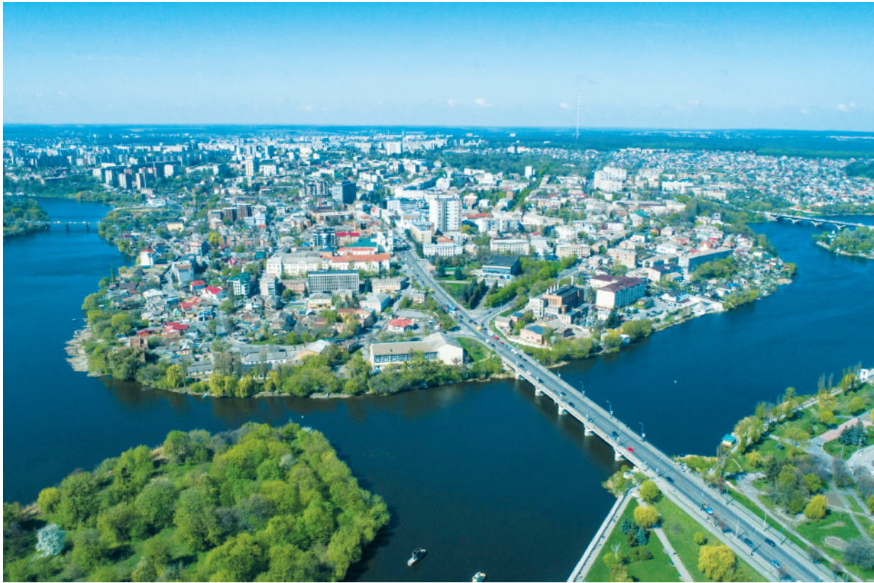
Figure 4. The central part of the Vinnytsia.

Vinnytsia water supply (1912) and others. The development of the system of engineering networks contributed to the construction of large buildings, such as the Savoy Hotel (1913) [7].