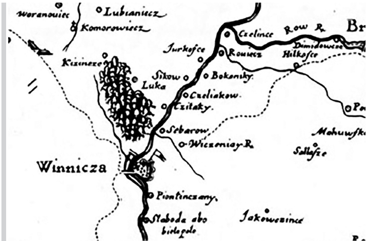
Figure 1. Vinnytsia on the special map by G. de Boplan, 1650. (North at the bottom) [13]

cial, economic, and architectural development of Vinnytsia. Due to the Polish magnates, scientists and artists Vinnytsia at that time experienced significant development of the urban planning system. During this period, new principles of settlement, development of territories and defense activities, which were worked out by Sh. Starovol'sky, K. Opalinsky, G. de Boplan (Fig. 1) and other urbanists of Poland, were applied [3].