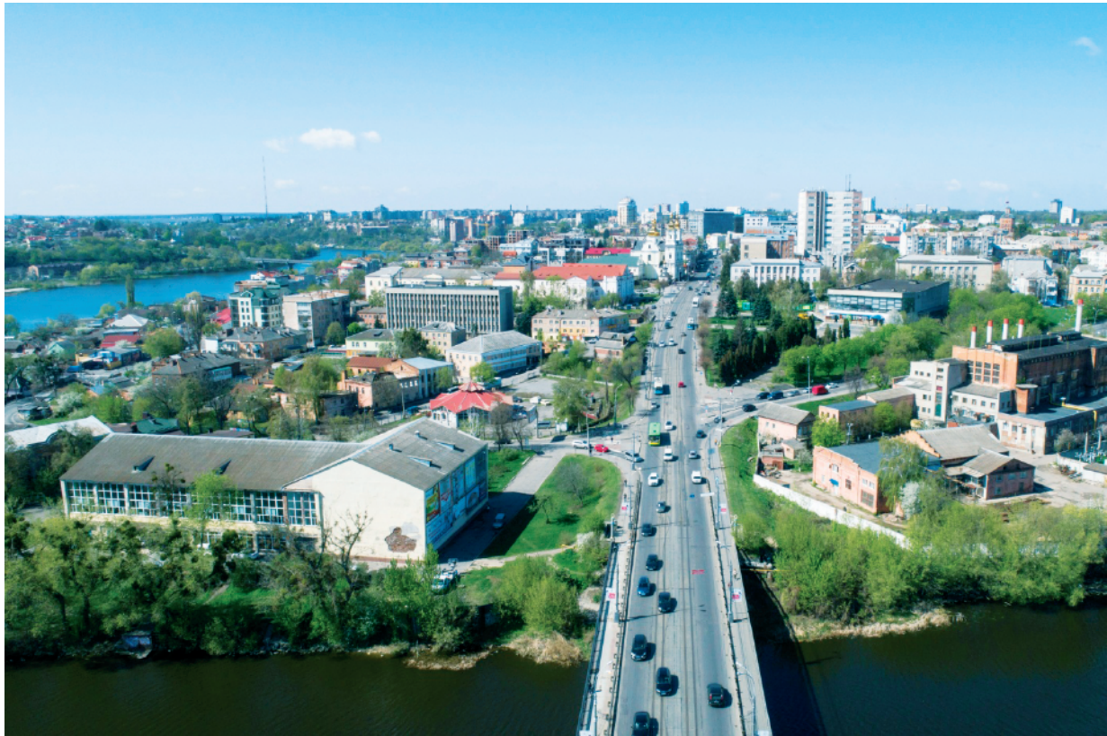
Figure 5. The central part of the Vinnytsia. For the effective use of the coast of the Southern Bug, there works on river bed cleaning and the river banks stabilization are needed.