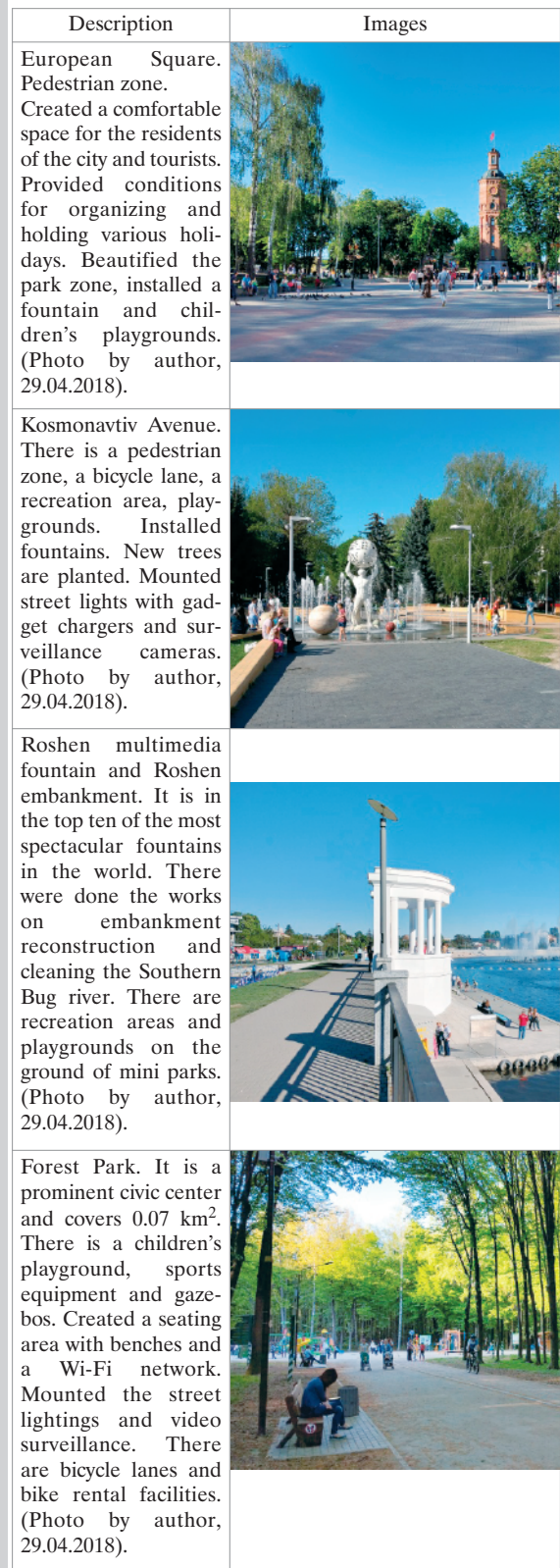
Table 1. The modern urban spaces of Vinnytsia

Today Vinnytsia is a vivid example of the effective implementation of best practices of the integrated concept of urban development in Ukraine. Thanks to the fruitful cooperation of the city administration,