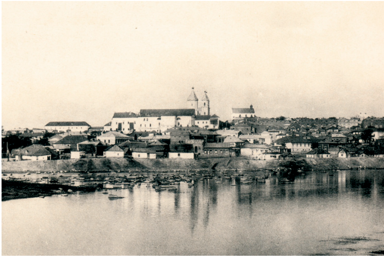
Figure 2. The view of the New City from Zamostya, a photo by Reicher, the end of the 19 th century [11]