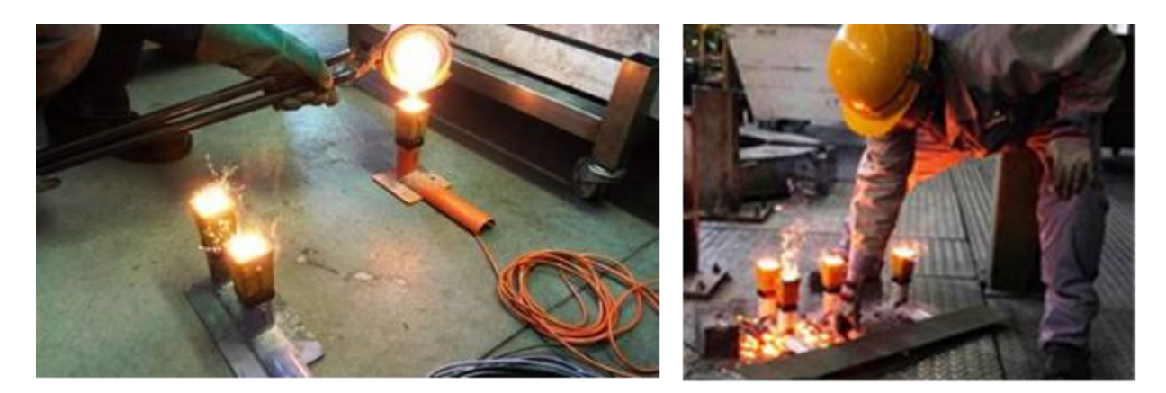
Figure 1 – Filling and cooling of samples at TA [1]

The vast majority of castings from metals and alloys are obtained in sand moulds, therefore, according to the State Standard GOST 24648-90, it is recommended to cast samples for mechanical tests of cast iron into moulds made of quartz sand, and only for castings obtained in metal moulds, it is allowed to cast samples into metal moulds. The task was to make a sand sampler as a mould for casting iron.