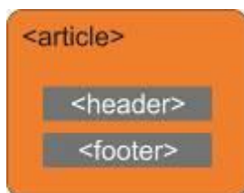
Figure 2 - The page with three of HTML5's semantic elements – article, header and footer

Figure 2 shows the final structure of the page.