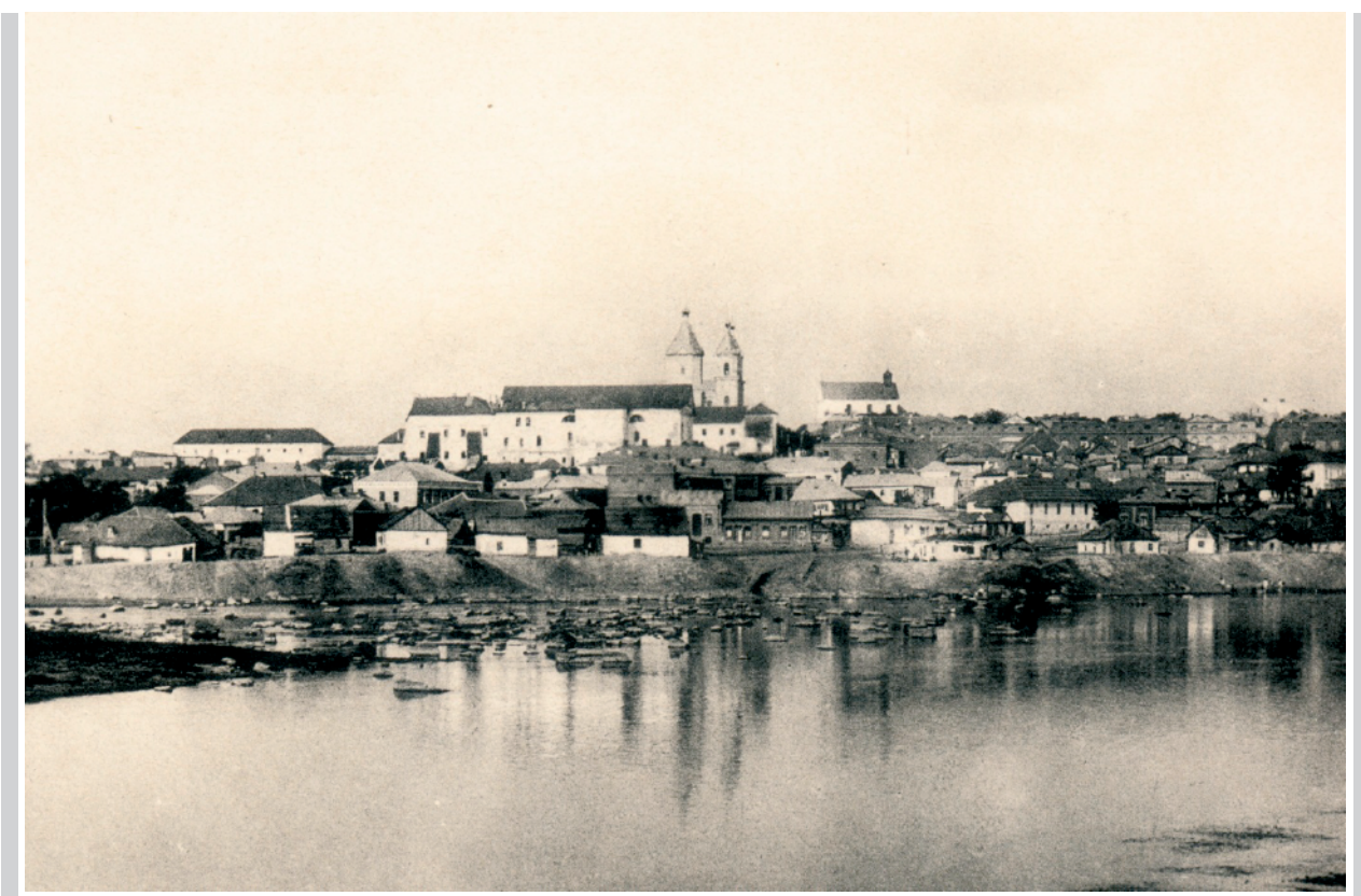
Figure 2. The view of the New City from Zamostya, a photo by Reicher, the end of the 19<sup>th</sup> century [11]