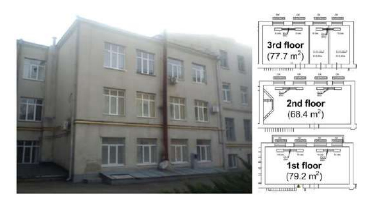
Fig. 2. Full-scale object for studying the efficiency of heat consumption