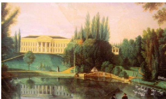
Fig. 6. Park. Watercolor. Early 19-th century.