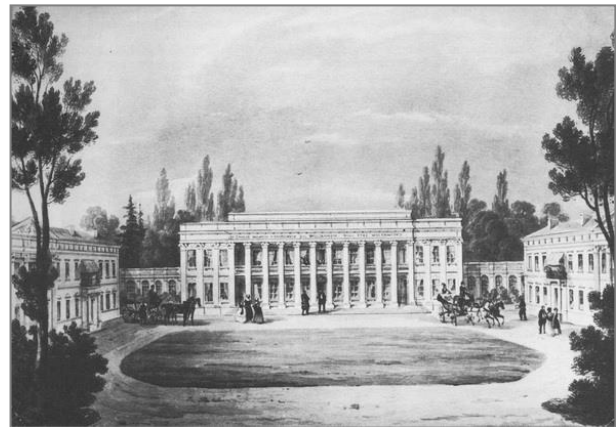
Fig. 3. The palace. Watercolor by Rikhter, 1835.

In Lenin Street in Tulchyn there is another palace built by Shchesny Pototskyi for his wife Josephine, so called the “new” one, which is less by the size and is inferior in architecture and grandeur but, at the same time, is no less well-known (Malakov, 1980). The old and the new palaces were linked by the underground passage with the width that let take a ride of the four horses.