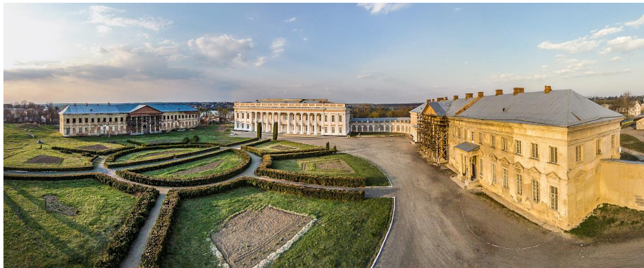
Fig. 1. The Pototskyi Palace in the town Tulchyn. Photo by M. Rytus (2017)

The historic preconditions of creating the palace ensemble in Tulchyn trace their roots to the 15th century. Modern Tulchyn is a district center located in the south part of Podillia Plateau, 82 km from the region center of Vinnitsia. The town came into being in the 15th century in the territory that at first constituted the Grand Prince Land Fund of Lithuanian state (Setsinski, 1911). The Polish historians of the 17th century assume that this settlement had the name of Nestervar and was built on the bank of the river Silnitsia. The main and the first mentions of this settlement date back to the early 17th century, the time of its belonging to the major Polish magnates Kallinovski by which the castle and a wooden Catholic church were erected (Krzyżanowski, 1862). Due to Zboriv Agreement signed in 1667 Nestervar was added to Cossack regiment of Bratslav Voivodeship, and after Andrusiv agreement signed in 1667 joined Polish-Lithuanian Commonwealth (Gulman, 1901).