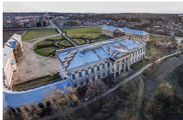
Fig. 5. Main axis palace-cathedral». (Rytus, 2016)

The problem of sewerage and heating systems in the palace was solved in up-to-date way. The water closets had to be situated in a middle part of the main building as well as in the three places of the wings. The vertical canals joint with the horizontal ones led up to the ground floor of each building under the floor. Further canals connected them with the reservoirs hidden in the ground at the bottom of the garden. The heating was provided due to the canals placed in the inner walls of both floors. Apart from the marble fireplaces, which gave only inconsiderable increase in temperature, some premises of the palace contained the stoves. Several such stoves had been preserved yet to the postwar period (Rolle, 1864).