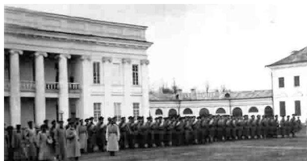
Fig. 7. Photo of the palace in 1912.

In 1911, the palace together with a large garden were changed into the caserns and the officers’ sitting of the 76-th Kuban infantry regiment (Chubina, 2010).