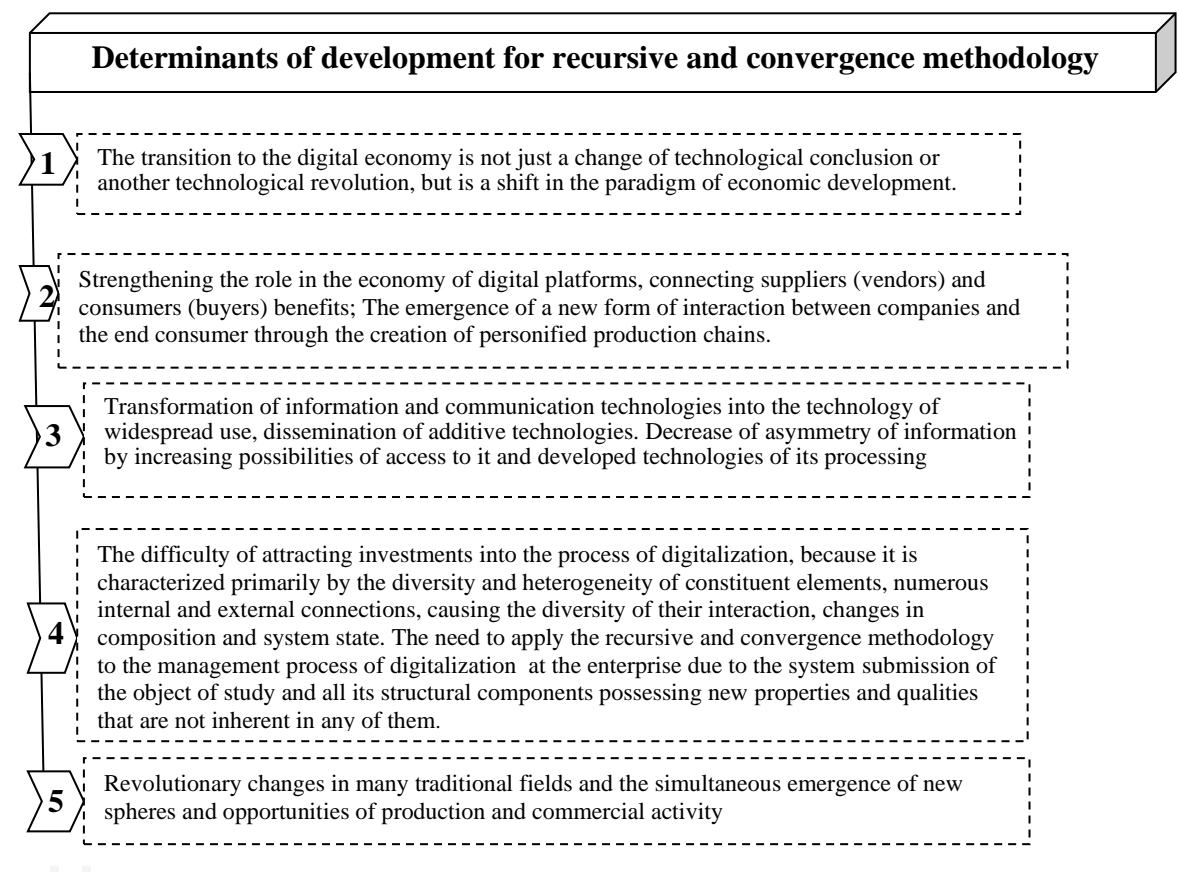
Fig. 3. Determined 5-component model of recursive and convergence methodology of digitalization investment management development at the enterprise

Because, the recursive model assumes management of the digitalization investment in the enterprise as a consistent transition between the processes of one level only after all the envisaged cycles of the current process are implemented. It is proposed that such a coherent sequence is possible due to the effective information support of each process, which should be implemented on the basis The prerequisite convergence. implementation of the developed recursive and convergence methodology in the field of digital technologies is civilization development, the consequences of globalization and digitization. The recursive and convergence methodology is the understanding digital based on of transformation management in an enterprise as a complex system, characterized primarily by the diversity and heterogeneity of the constituent elements, the numerous internal and external relationships, which causes the diversity of their interaction, changes in composition.